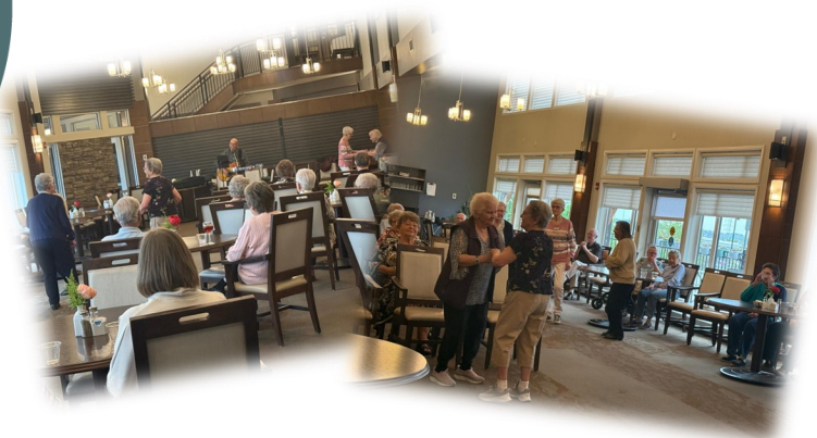
Friday Happy Hour