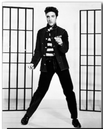
This Elvis Presley publicity photo shows off one of his now-famous moves.

On July 18, 1953, a young man named Elvis Presley walked into the Sun Records studio in Memphis, Tennessee, to make his first record. The resulting acetate disc, with just two songs—"My Happiness" and "That's When Your Heartaches Begin"—was supposed to be a gift from Elvis to his mother. Rumor has it, though, that the Presleys did not even own a record player. Many speculate that the recording was an attempt to get the attention of Sun Records owner Sam Phillips. Apparently, Elvis made an impression, because he was invited back to the studio a year later. At first, the session was uninspiring, but then Elvis began goofing off and singing. That sound was just what Phillips was looking for, and the "King of Rock 'n' Roll" was born.