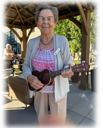
Seniors Month: Grandchildren Visits & Games, Fancy Double 'C' Cloggers, Raffle Draw & Garden of