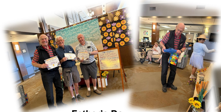
Father's Day Fishing Derby