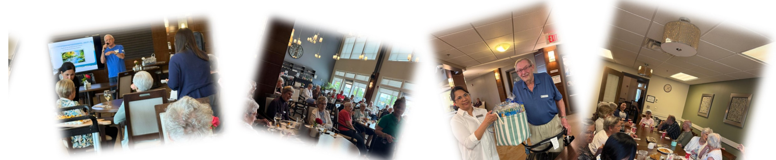
Happy Hour Travelogue to New Zealand