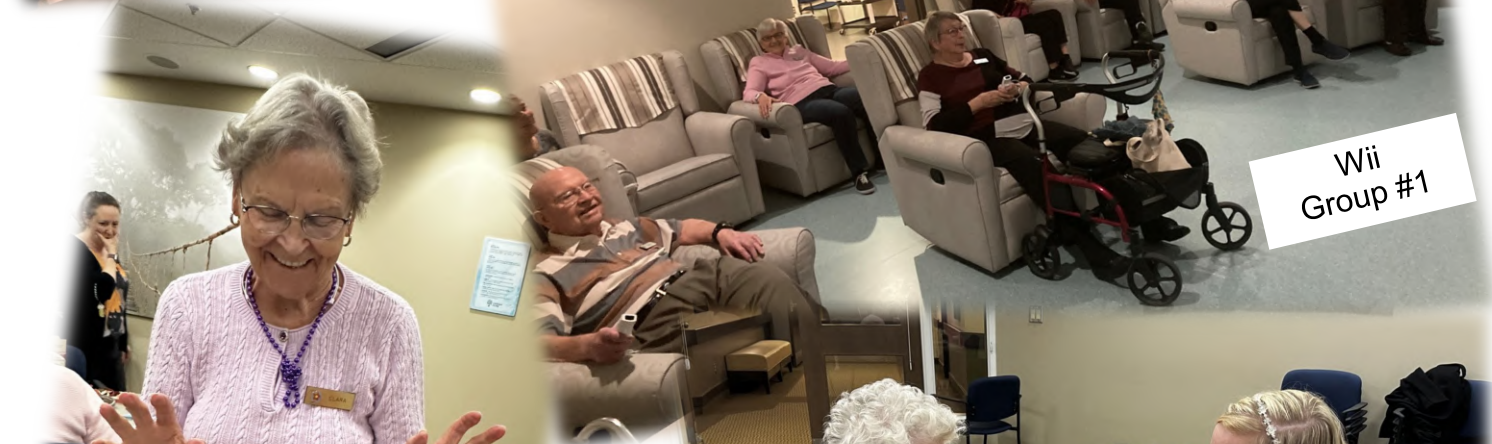
Wii Group #1